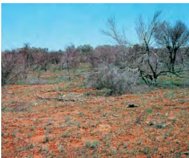
Figure 1c. Several months later the bushes are dead (91 per cent of the hopbush was killed) and the paddock is regenerating after the burn.

Management of existing INS and new seedlings is a major priority for landholders in western New South Wales. This fact sheet examines the principles of management burning as a proven tool for tackling the ever increasing problem of INS encroachment.