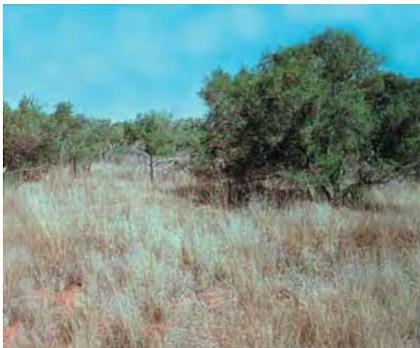
Figure 1a. Before the management burn. Note the good cover of grass fuel.