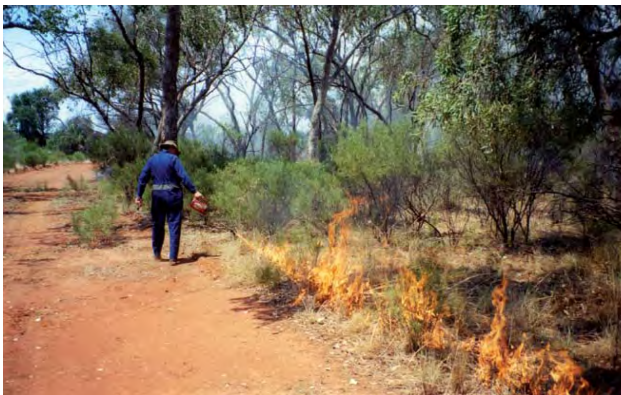
Management burning is a proven tool for tackling the ever increasing problem of INS encroachment.

Dense stands of INS also reduce habitat diversity. INS favours certain fauna species such as insectivorous birds, but the decline of grass-timber mosaics affects a range of other birds and wildlife. Established INS can also lead to the decline of perennial groundcover and soil erosion. Uncontrolled grazing pressure from feral, native and domestic animals worsens these effects by reducing pasture vigour.