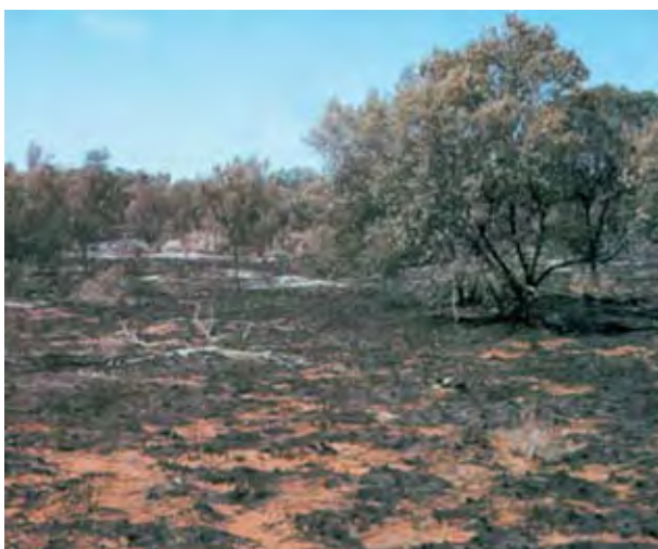
Figure 1b. Immediately after the management burn. Although the large bushes still have leaves, they have been scorched to the top and will die.